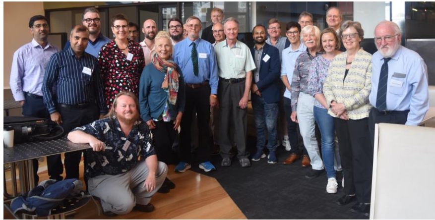
The 20 th Biennial Conference Photograph